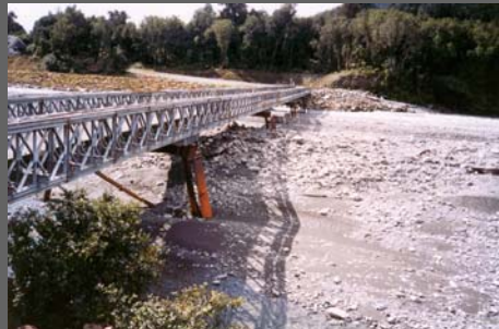
Bridge over Waiho River, Franz Josef

Determine factors that lead to successful community group outcomes and the influence these groups have on the adoption of hazard mitigation policy development and implementation of hazard mitigation measures.